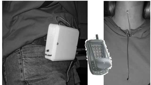
Figure 1. SenSay: sensor box mounted on the hip (left), the mobile phone (center), and voice and ambient microphones mounted on the user (right).

In a much more limited context the idea of smart appliances and phones was explored in [1], [3], [4] and [5]. In [2] concepts of context-aware computing and wearable devices have been described.